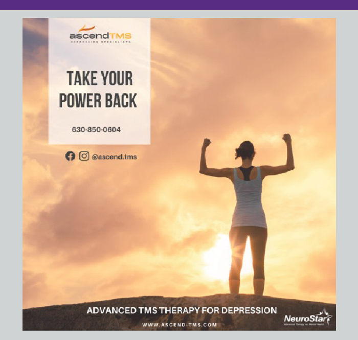
This month we are featuring a social ad from Ascend TMS in Illinois.